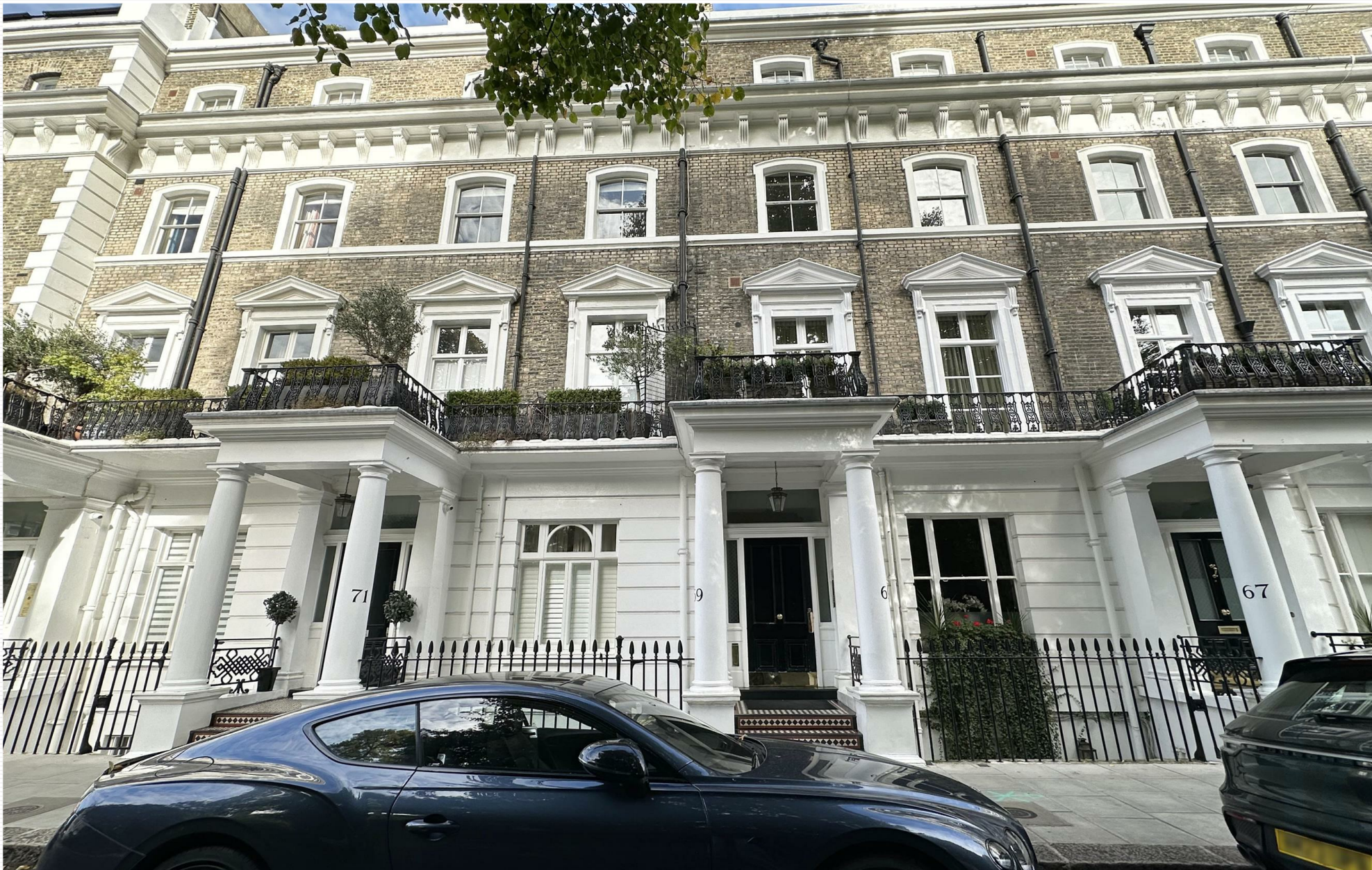
Onslow Square, South Kensington, SW7 3LS

Guide Price £3,750,000 Share of Freehold